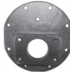
9 1/8" Diameter Bolt Pattern