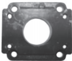
4 1/4" x 4 1/4" Bolt Pattern

Custom adapter flange for use with a skidmore pump mounted when used on an existing steel receiver