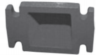
ITT Domestic Hoffman Pumps © * Up to 130 GPM flow rate do not require an adapter flange