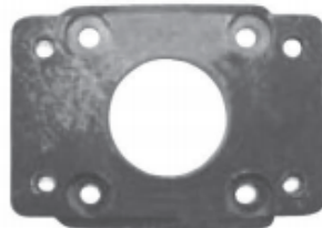
3 3/4" x 3 3/4" Bolt Pattern