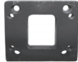
4 1/4" x 4" Bolt Pattern