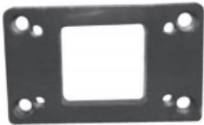
6 1/4" x 3 1/4" Bolt Pattern