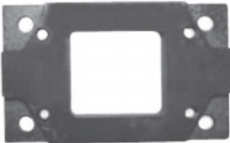
6 1/4" x 3 1/2" Bolt Pattern