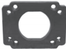
3 1/4" x 3 1/4" Bolt Pattern (1) Cover w/1 gasket Included